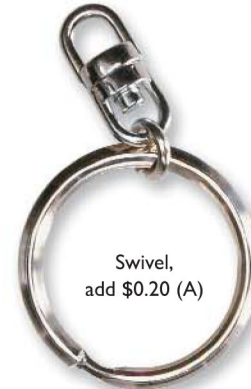
Swivel, add $0.20 (A)