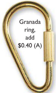
Granada ring, add $0.40 (A)