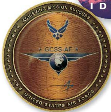
4-color process insert