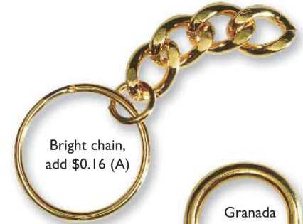
Bright chain, add $0.16 (A)