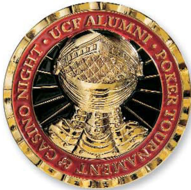
Diamond cut edge

Suggested here: Enhancements to your medallion that add eye-appeal! Call our Pin Consultants for pricing.