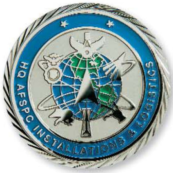
Spiral cut edge